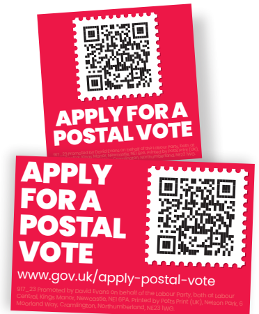
Sticker and business card